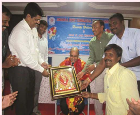
Physical Directors of Affiliated Colleges felicitating Vice-Chancellor