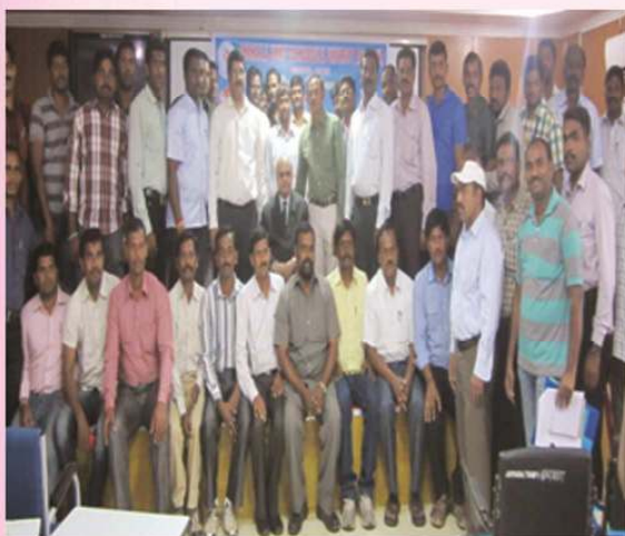
Physical Directors attended for 5th General Body Meeting

JNTUA Annual Physical Directors' Meeting was held on 18.7.2013. All the Physical Directors have felicitated the Hon'ble VC for successfully completing first one year service at JNTUA.