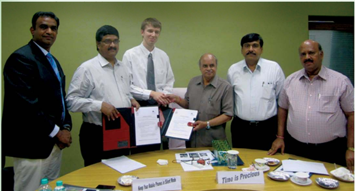
JNTUA ties up with Eastern Illinois University, USA